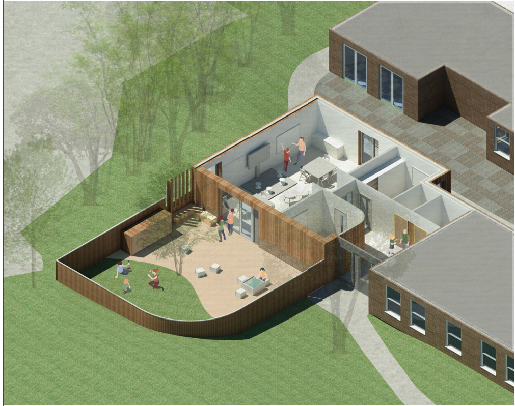
3D View of Proposals (roof removed)